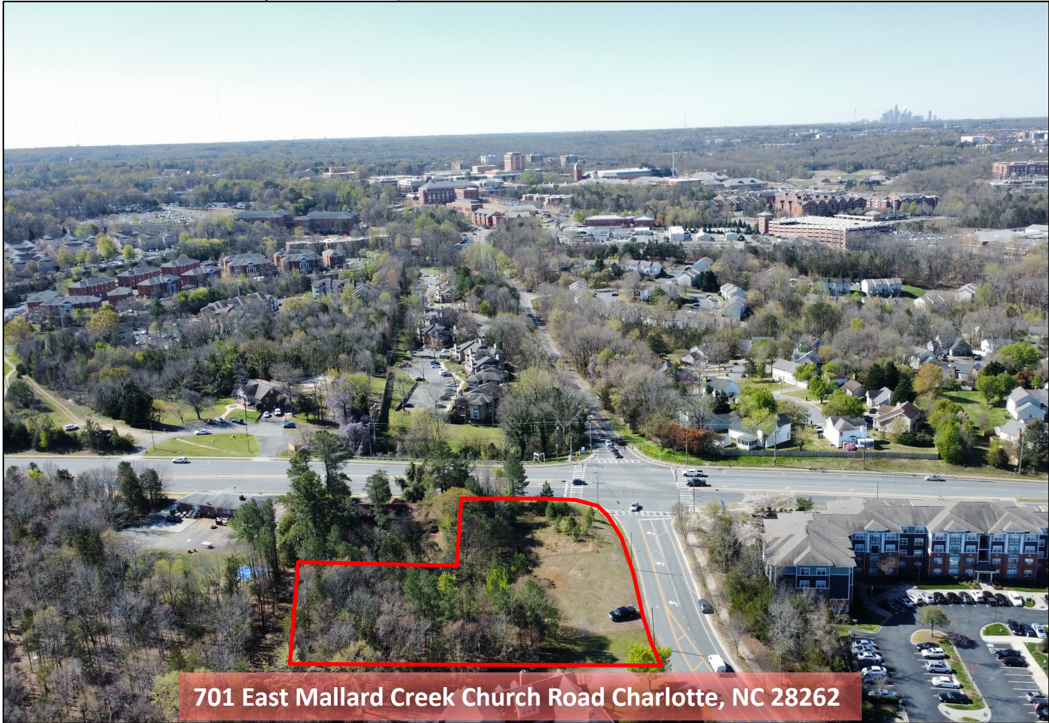
701 East Mallard Creek Church Road Charlotte, NC 28262