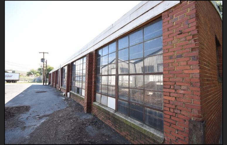
Building 1 Windows