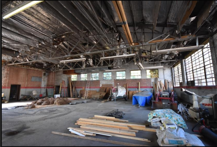
Building 1 Interior