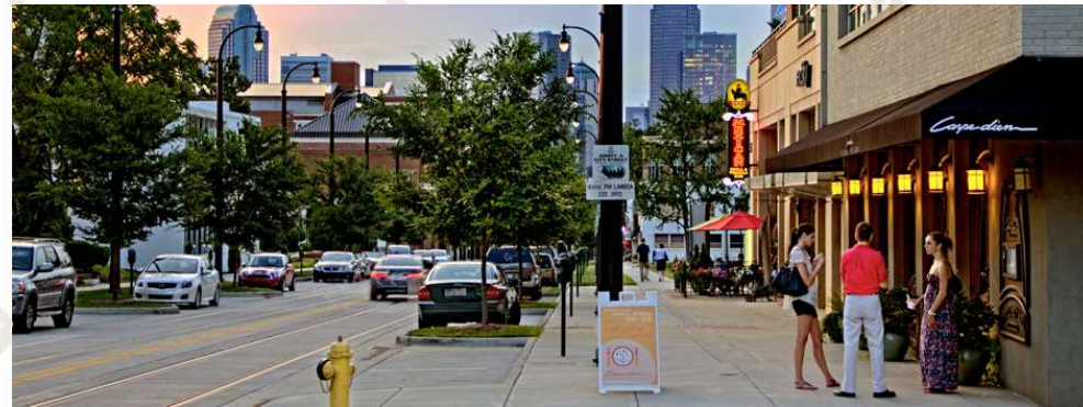
LYNX Gold Line/Elizabeth Ave