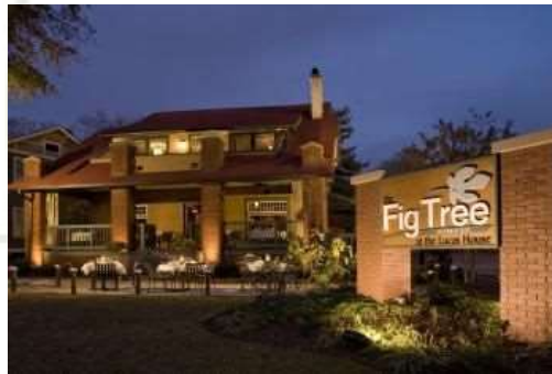
Fig Tree Restaurant