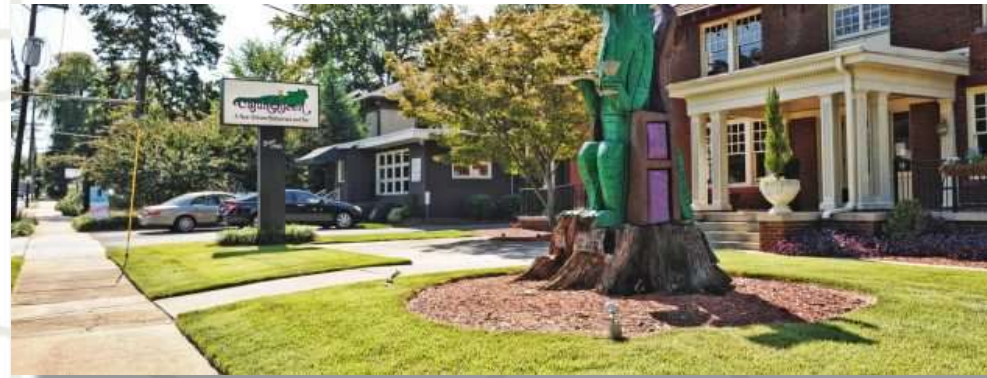
Cajun Queen Restaurant