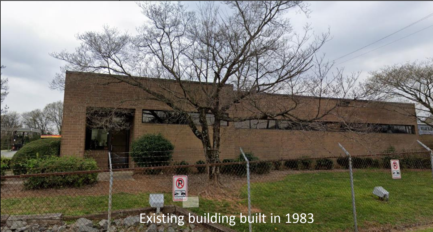
Existing building built in 1983